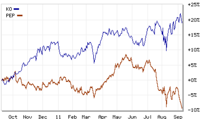
Coca-Cola vs Pepsico